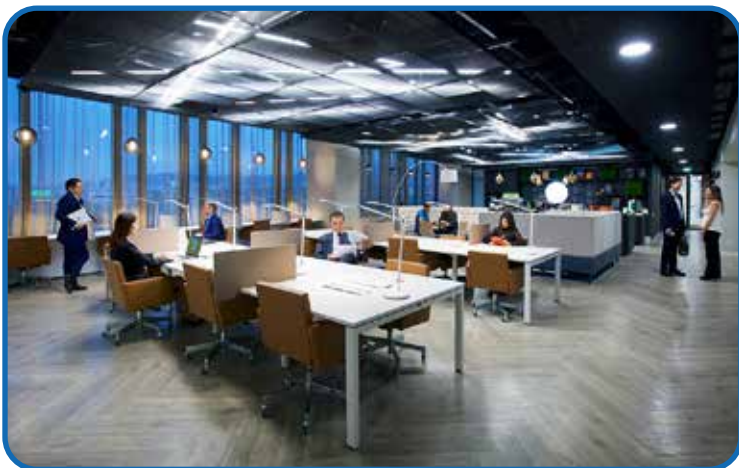
Esentai Tower (Kazakhstan)