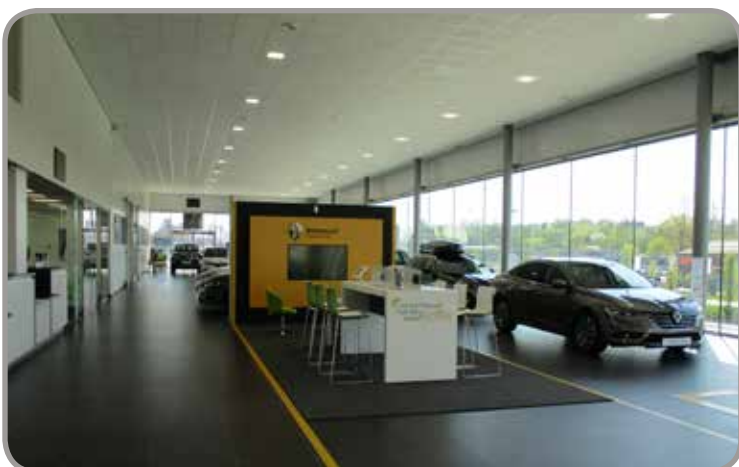
Renault Garage, Leuven (Belgium)