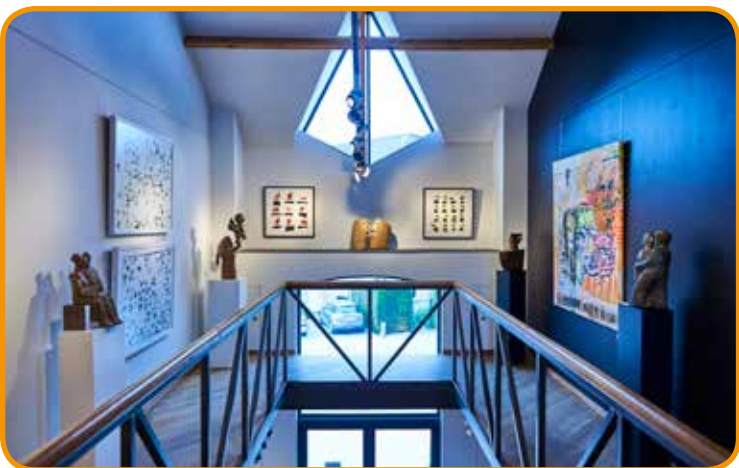
Art Gallery, Lommel (Belgium)