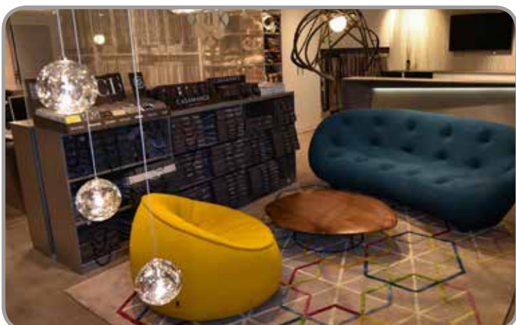
Design textile store, Bevlo (Hungary)