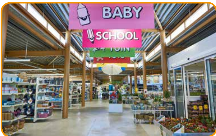
Happy Land, As (Belgium)